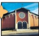
St. Hyacinth Church 63 Pulaski St.