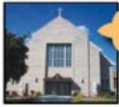
St. Francis Church 303 Clark Street