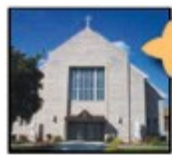
St. Francis Church 303 Clark Street