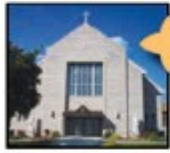
St. Francis Church 303 Clark Street