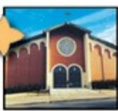
St. Hyacinth Church 63 Pulaski Street