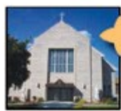
St. Francis Church 303 Clark Street