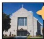
St. Francis Church 303 Clark Street