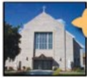
St. Francis Church 303 Clark Street