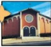
St. Hyacinth Church 63 Pulaski St.