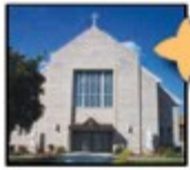
St. Francis Church 303 Clark Street